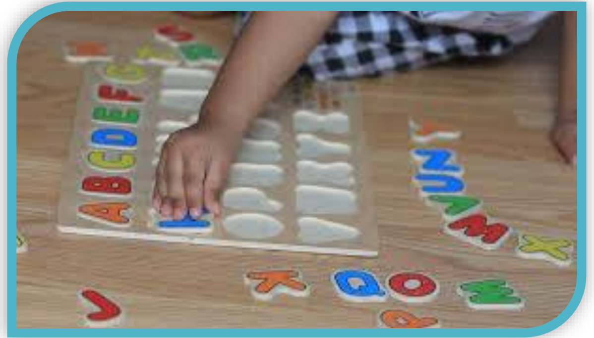
Build a puzzle